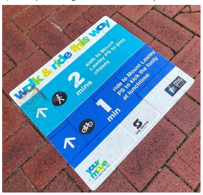
Figure 1 - Your Move Safe Route to School decals

MLPS Walking Bus follows three separate Safe Routes identified through the Department of Transport's Your Move program, the City of Striling and MLPS community. Refer to routes overleaf.